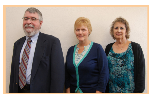
The District's Customer Service staff is available to assist you Monday through Friday, 8 AM to 5:30 PM.